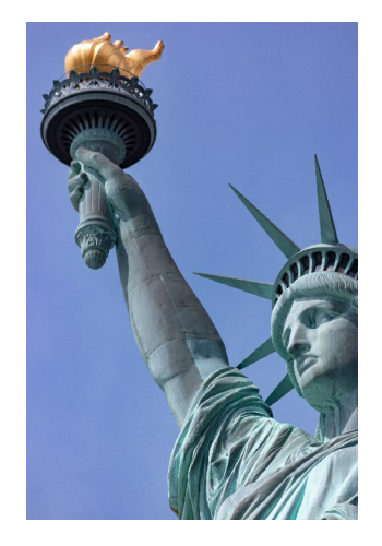
July - In Celebration of Independence Day

Deadline for submissions is the 15th of every month.