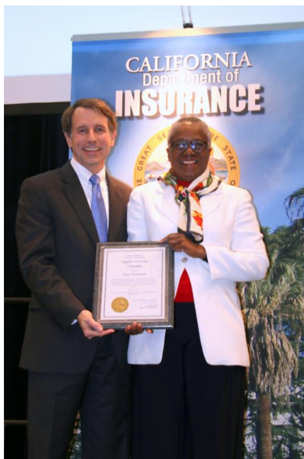
Supplier Diversity Champion Kaiser Permanente