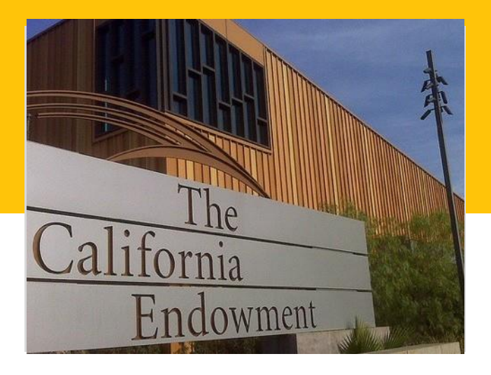
The California Endowment 1000 N. Alameda Street Los Angeles, CA 90012

This year, we are proud to host our 7<sup>th</sup> Annual Insurance Diversity Summit in Los Angeles at the California Endowment whose mission is to expand access to affordable, quality healthcare to California's underserved communities, and to promote fundamental improvements in the health status of all Californians.