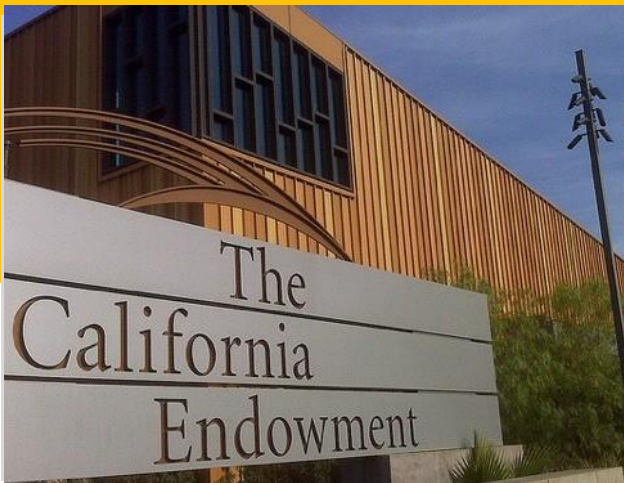
The California Endowment 1000 N. Alameda Street Los Angeles, CA 90012

This year, we are proud to host our 7 th Annual Insurance Diversity Summit in Los Angeles at the California Endowment whose mission is to expand access to affordable, quality healthcare to California’s underserved communities, and to promote fundamental improvements in the health status of all Californians.