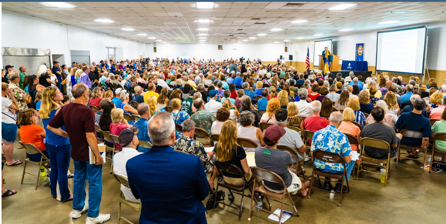
Commissioner Lara speaking to hundreds of Placer County residents on August 28, 2019.