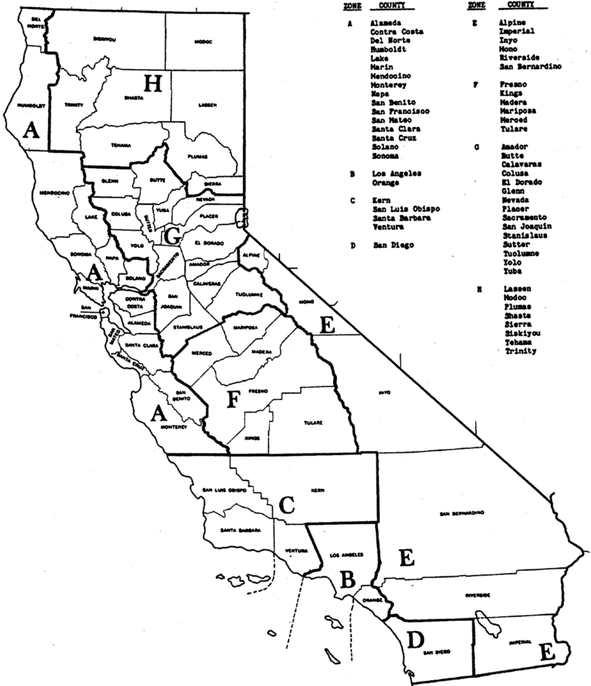
FIGURE 1 California Department of Insurance Earthquake Zones.