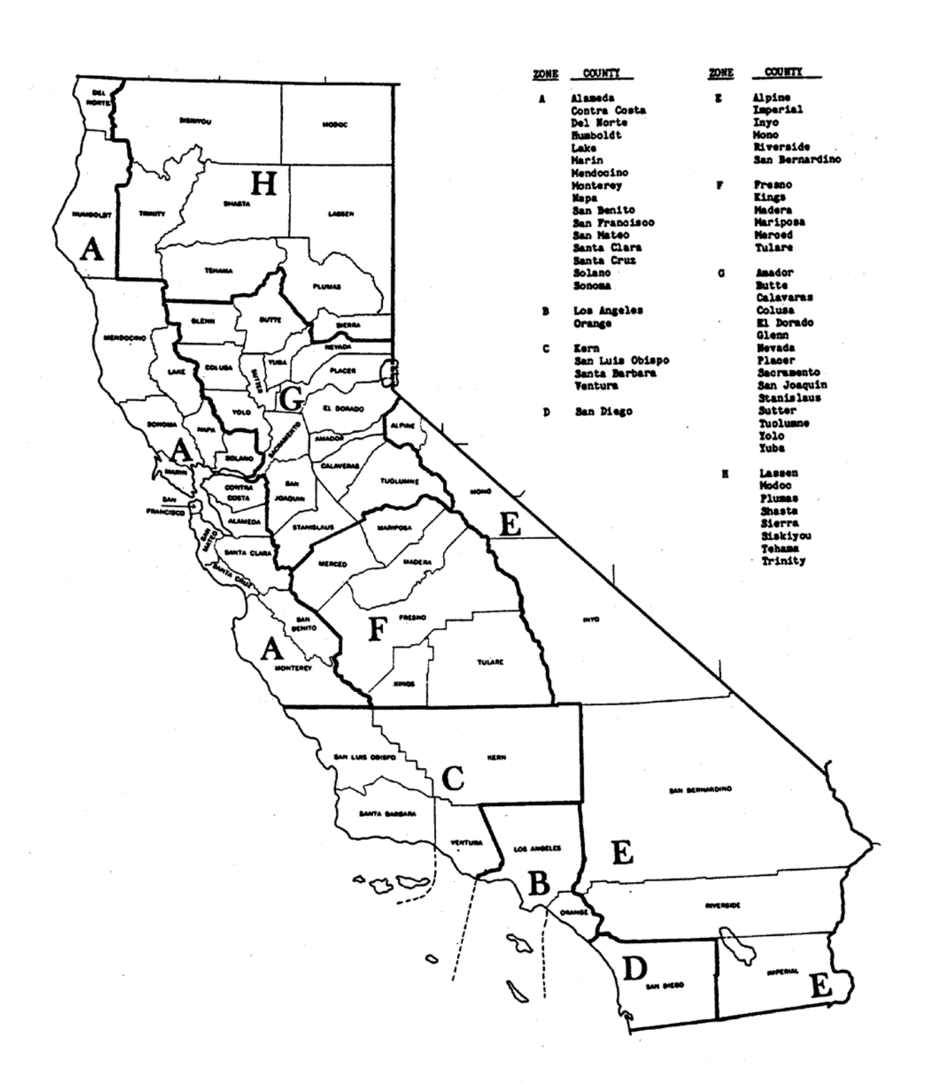
FIGURE 1 California Department of Insurance Earthquake Zones.