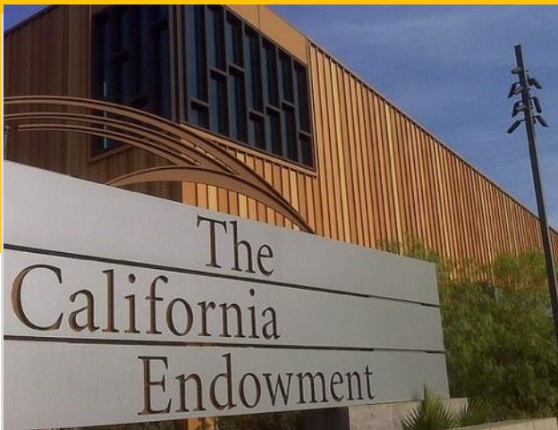
The California Endowment 1000 N. Alameda Street Los Angeles, CA 90012

This year, we are proud to host our 7 th Annual Insurance Diversity Summit in Los Angeles at the California Endowment whose mission is to expand access to affordable, quality healthcare to California's underserved communities, and to promote fundamental improvements in the health status of all Californians.