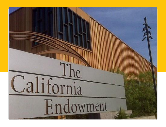
The California Endowment 1000 N. Alameda Street Los Angeles, CA 90012

This year, we are proud to host our 7<sup>th</sup> Annual Insurance Diversity Summit in Los Angeles at the California Endowment whose mission is to expand access to affordable, quality healthcare to California's underserved communities, and to promote fundamental improvements in the health status of all Californians.