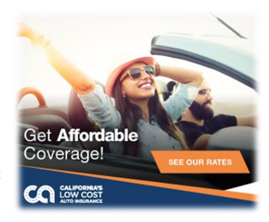
Sample digital ad

Digital media offers the best opportunity to narrowly target multiple and specific audiences in geographically targeted areas. It also allows CLCA the ability to collect, analyze, and respond to consumer behaviors quicker and more effectively. With all digital mediums working together, driven by planned and precise lead generation goals, digital advertising drove more consumers to the website with better conversions. In addition, the ads helped pass along leads to partners in the field and more importantly, generated cost effective acquisitions for the campaign as a whole.