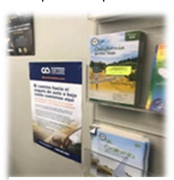
Fontana DMV displaying CLCA materials

In addition, the contractor established key statewide partnerships, broadening reach to eligible consumers. These efforts targeted law enforcement agencies, senior service agencies, traffic safety programs, colleges, and 211 organizations.