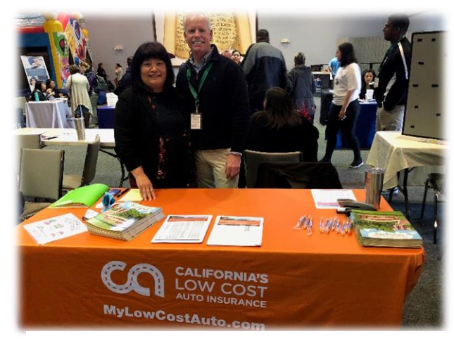
Outreach specialist with Producer at Faith Community Church Health Fair, Clovis, CA

Because Producers are consumer-facing, they are a valuable program asset to assisting consumers. The outreach team provided support and increased program knowledge via tips-of-themonth, updated training materials, and job aids. Producers were provided a resource website to access program logos, newsletter and social media ads, AB60 resources, and more. These efforts were designed to connect producers to community organizations, as well as to increase conversion rates and enrollments. Because network partners have trusted relationships with constituents, the team established relationships between the partners and Producers to facilitate a "warm" handoff to break down barriers for those historically underserved. The