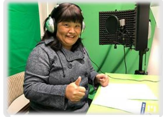
Outreach specialist conducting radio interview at KBIF 900AM Hmong Radio

Radio and TV public affairs programming successfully reaches thousands of targeted consumers. The outreach team brokered pro bono radio and TV appearances and interviews to promote CLCA. Through successful negotiations, 30-minute interviews were broadcast or looped during free and open programming air time. Customized scripting based on frequently asked questions were developed to help hosts develop interview content.